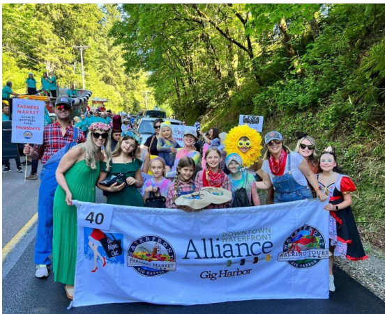
The Maritime parade was this last weekend in Gig Harbor! The parade was organized by The Gig Harbor Downtown Waterfront Alliance. Many volunteers dressed up to represent the events that they put on throughout the year!