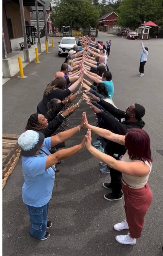
Volunteers join hands as the last snack pack is loaded onto the truck.